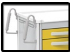
Flexible plastic top